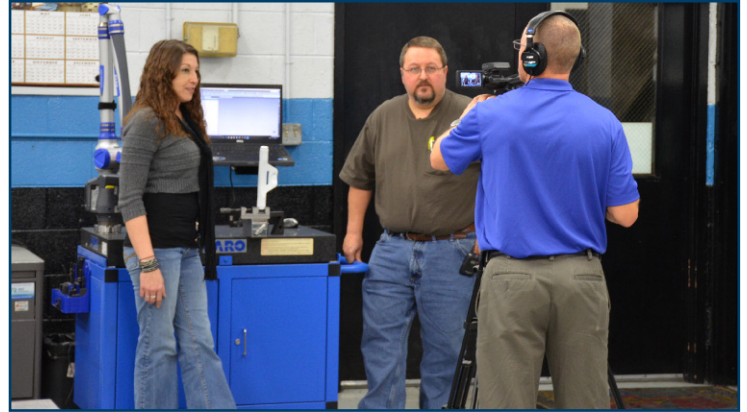
The BTES Power 7 Crew interviewed several employees and went through the step-by-step process for making forgings.

Their outlook on the future is one of continuous growth and expanding partnerships.