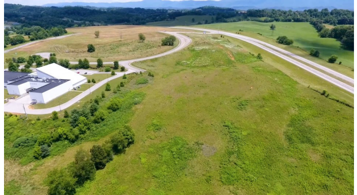
An aerial view of the Bristol Business Park located on Highway 394.